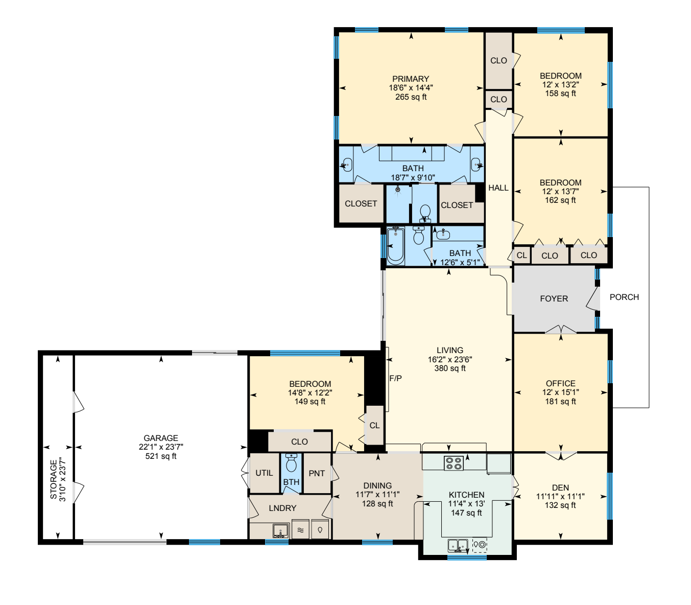
Main Floor Exterior Area 2575.63 sq ft Interior Area 2413.20 sq ft